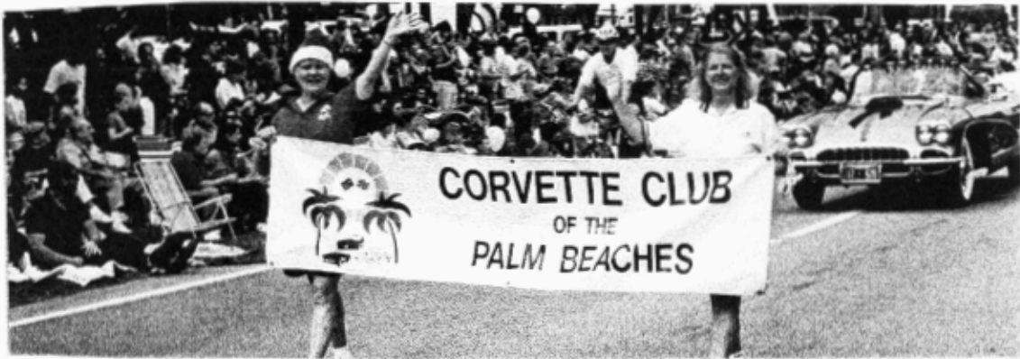
Wellington Christmas Parade